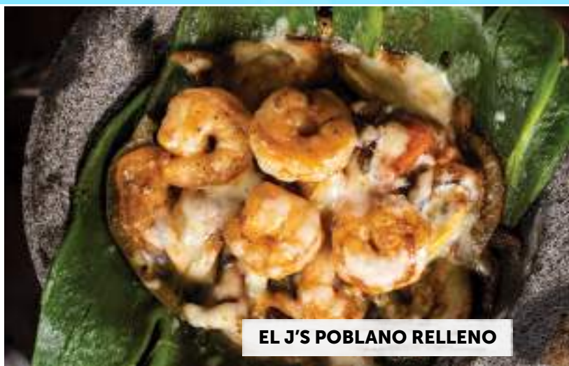
EL J'S POBLANO RELLENO