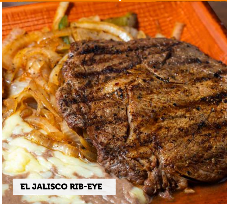
EL JALISCO RIB-EYE