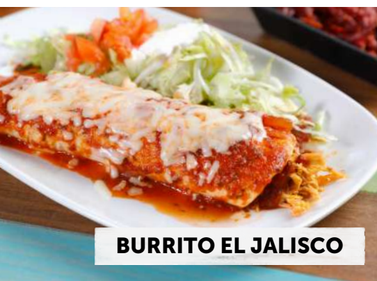
BURRITO EL JALISCO