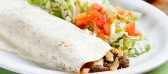
CHEESE STEAK BURRITO