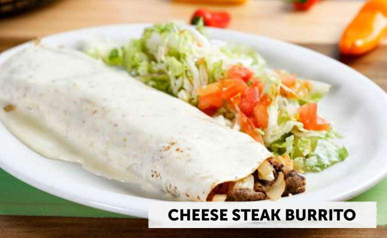
CHEESE STEAK BURRITO