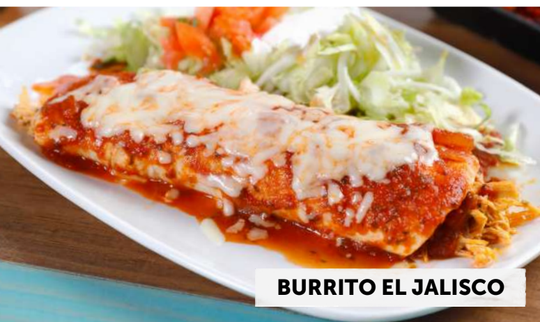
BURRITO EL JALISCO