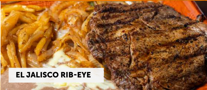
EL JALISCO RIB-EYE

10oz rib-eye steak (USDA Select) with grilled vegetables. Served with rice, beans and tortillas. $17.75 (Add Shrimp(6) for $6)