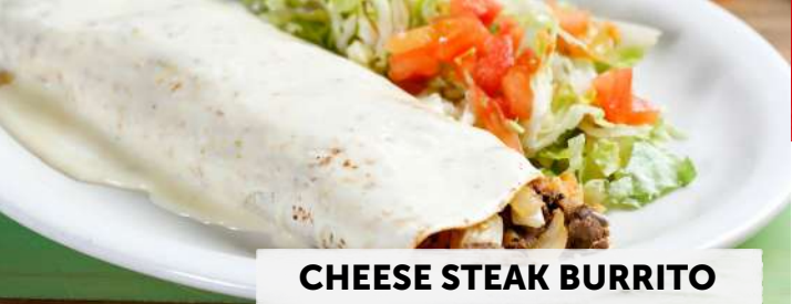
CHEESE STEAK BURRITO