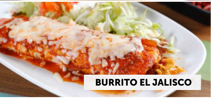
BURRITO EL JALISCO