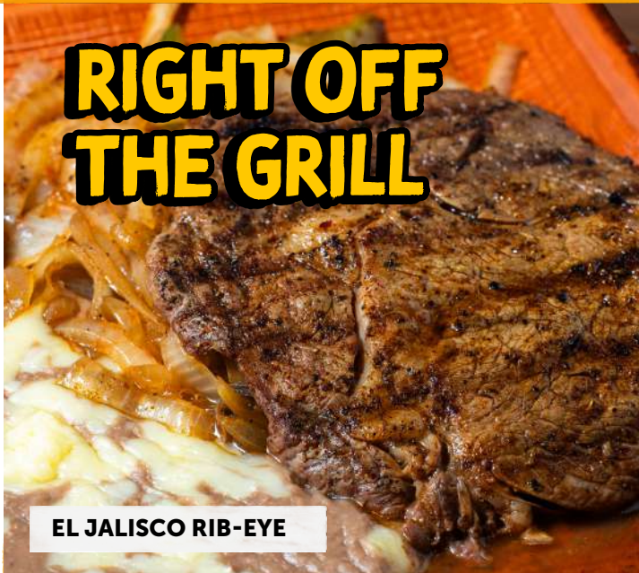
EL JALISCO RIB-EYE