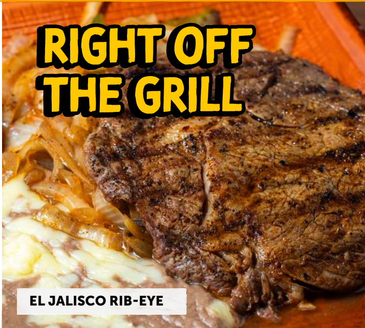
EL JALISCO RIB-EYE