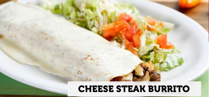
CHEESE STEAK BURRITO