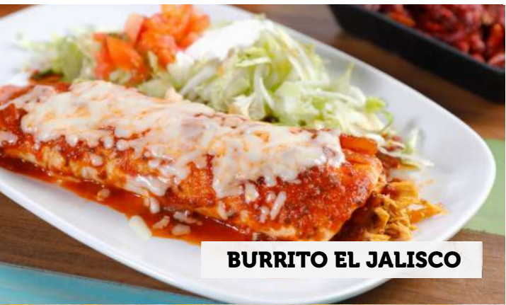
BURRITO EL JALISCO