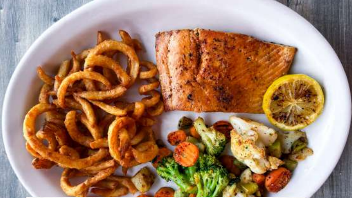
Salmon Served with mixed vegetables and seasoned curly fries on the side. $17.24

Try our delicious pasta with your choice of chicken or shrimp. Chicken $18.99 Shrimp $21.99