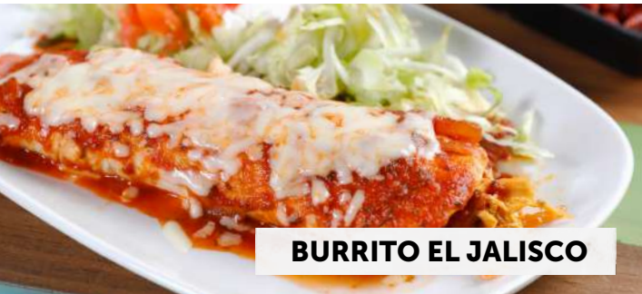
BURRITO EL JALISCO