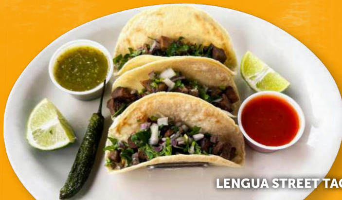
LENGUA STREET TACOS

WE HAVE STREET TACOS WITH CARNE ASADA, CARNITAS, AL PASTOR, LENGUA, OR CHORIZO?!