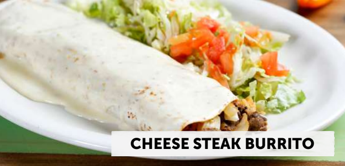
CHEESE STEAK BURRITO