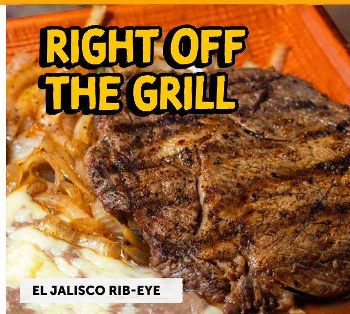
EL JALISCO RIB-EYE

10oz T-Bone grilled to your satisfaction with rice, grilled vegetables and corn slices. $24