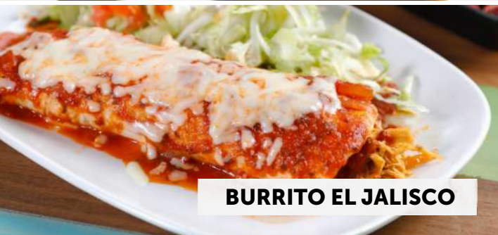
BURRITO EL JALISCO