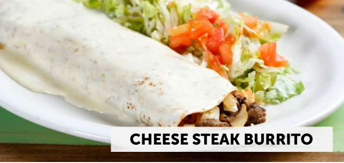
CHEESE STEAK BURRITO